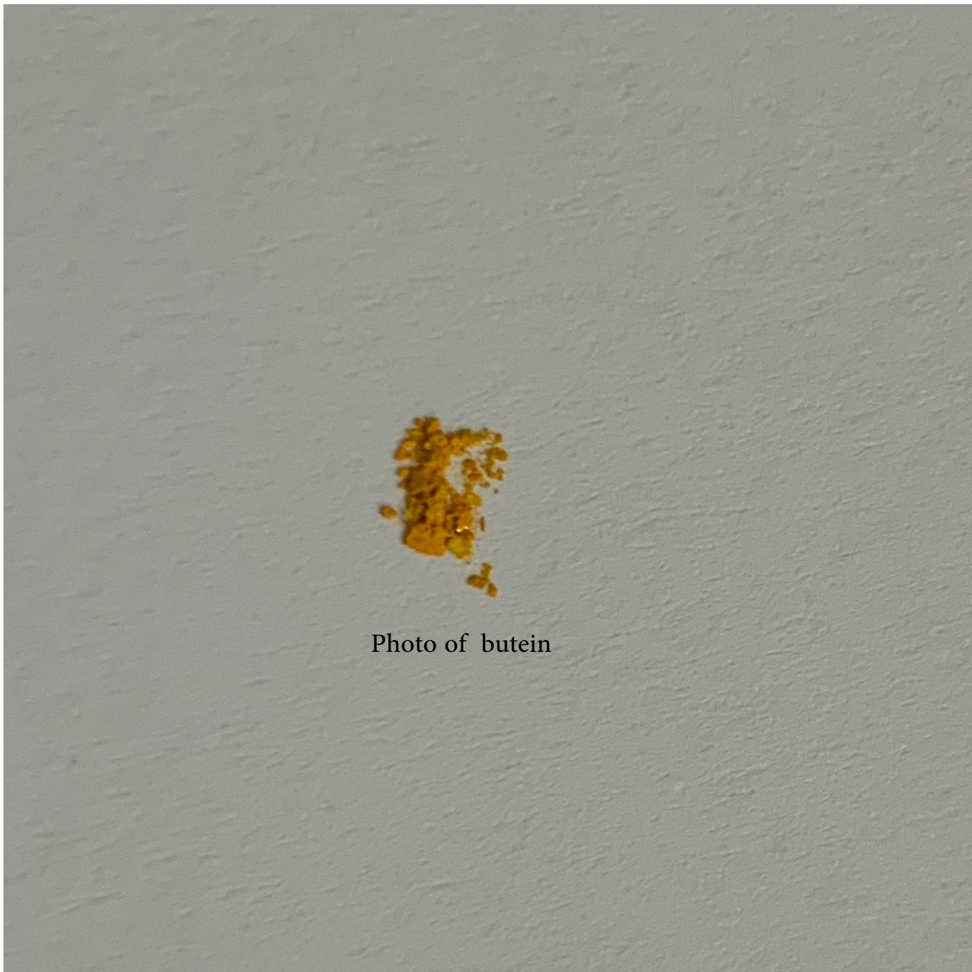
Photo of butein