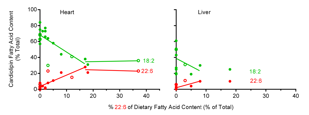
Analysis of 22:6 levels in heart CL (Figure 2) shows that when 22:6 is absent in the diet a small amount of 22:6 (2%–8%) is still present in CL, demonstrating conversion such as that of 18:3 by the liver (the primary 22:6 synthesizing organ in mammals [53]) and its incorporation into heart CL. When