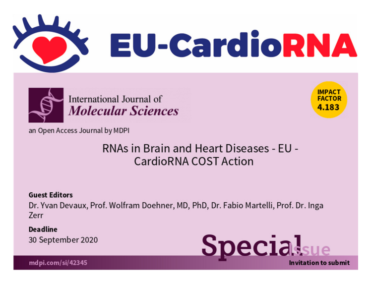
Figure 2. Banner of Special Issue "RNAs in Brain and Heart Diseases - EU-CardioRNA COST Action".

Through the Special Issue "RNAs in Brain and Heart Diseases" in International Journal of Molecular Sciences (https://www.mdpi.com/journal/ijms/special_issues/rna_brain_heart_cost), members of the EU-CardioRNA COST Action CA17129 aim to provide a forum for reporting and discussion on the topic of RNAs in brain and heart diseases, focusing on organ interactions and common mechanisms between diseases. The banner is showed as Figure 2. The Special Issue specially welcomes regular research articles or review articles focusing on brain disease affecting the cardiovascular system or heart disease affecting the neurological system.