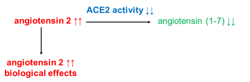
Figure 3. SARS-CoV-2 impacts on angiotensins ratio. SARS-CoV-2 causes inactivation of ACE2 enzyme, leading to negative biological effects of angiotensin 2 only.