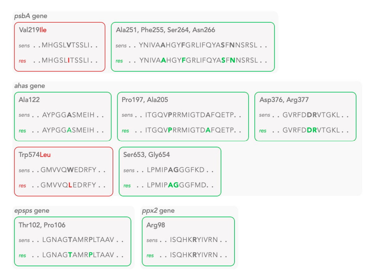
Figure 3. Amino acid mutations in investigated gene products. Imidazolinone and urea resistant bulked samples were analyzed by NGS-TAS that covered 16 known resistance-conferring mutations sites in A. artemisiifolia . Marking: green, possible mutation sites; red, mutant amino acids. DNA sequencing revealed that an inferred leucine for tryptophan substitution at amino acid position 574 in AHAS enzyme was responsible for the imazethapyr herbicide resistance. Amino acid substitution at the position 219 (valine/isoleucine) in psbA gene product, D1 protein, was responsible for the linuron resistance. Amino acid substitutions in EPSPS and PPX2 enzymes at known resistance-conferring mutations sites were not found.

To be able to identify the mutations causing resistance in A. artemisiifolia , bulked and amplified DNA sequences of imazethapyr and linuron resistant samples were further analysed by NGS-TAS that covered 16 known resistance mutations sites in A. artemisiifolia . In the AMI group, sequence alignment analysis showed that a single nucleotide in the ahas gene was changed from TGG to TTG and resulted in a Trp574Leu substitution conferring herbicide resistance [47] (Figure 3). Other amino acid substitutions in the D1 protein, EPSPS and PPX2 enzymes at known resistance-conferring mutations sites were not found. Based on these data, the investigated population was susceptible to PSII, EPSP synthase and PPO inhibitors (Figure 3). In the AMU group, sequence alignment analysis showed that a single triplet was changed (GTA to ATA) in the psbA gene and resulted in a resistance-conferring Val219Ile substitution [41] (Figure 3). Other amino acid substitutions in AHAS, EPSPS, and PPX2 enzymes at known resistance-conferring mutations sites were not found. Based on this data the investigated biotype was susceptible to AHAS, EPSP synthase, and PPO inhibitors in terms of TSR (Figure 3).