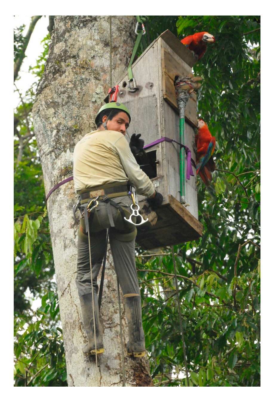
Figure 1. Nest check of an artificial Scarlet Macaw nest (wooden box) using a single rope climbing system. Both macaws are displaying nest defense behaviors. A stuffed leather glove attached to a metal stick is used as a tool to cover the nest entrance and prevent macaws from reentering the nest. In the picture, the researcher access door is open. Researcher: Gustavo Martinez Sovero MSc.