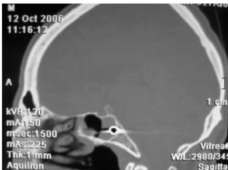
Fig. 2. Sagittal CT scan: projectile located in inferior posterior corner of the sphenoid sinus

1 and 2). Visual acuity was not evaluated because of right eye blindness caused by a. ophthalmica thrombosis and secondary glaucoma lasting for 2 years.