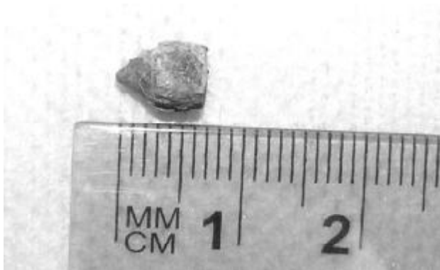
Fig. 3. Foreign body (0.8 cm) removed from the sphenoid sinus

The patient was taken to the operating room 6 weeks later, and retained projectile was removed using endoscopic techniques. Under control of 45° endoscope, left middle conchotomy was performed. After identifying natural ostium of sphenoid sinus, it was enlarged medially and down up to diameter of 10 mm. With endoscopic guidance, optic nerve and carotid were visualized. The missile was lodged in the corner of inferior posterior wall and was removed from the sphenoid sinus with special forceps (Fig. 3). The bleeding during operation was insignificant. Postoperative medical therapy consisted of cefazolin 3 g per day intravenously, nasal drops, and analgetics. The patient tolerated the procedure well and had uneventful postoperative course. He was discharged from the clinic after 4 days of follow-up.