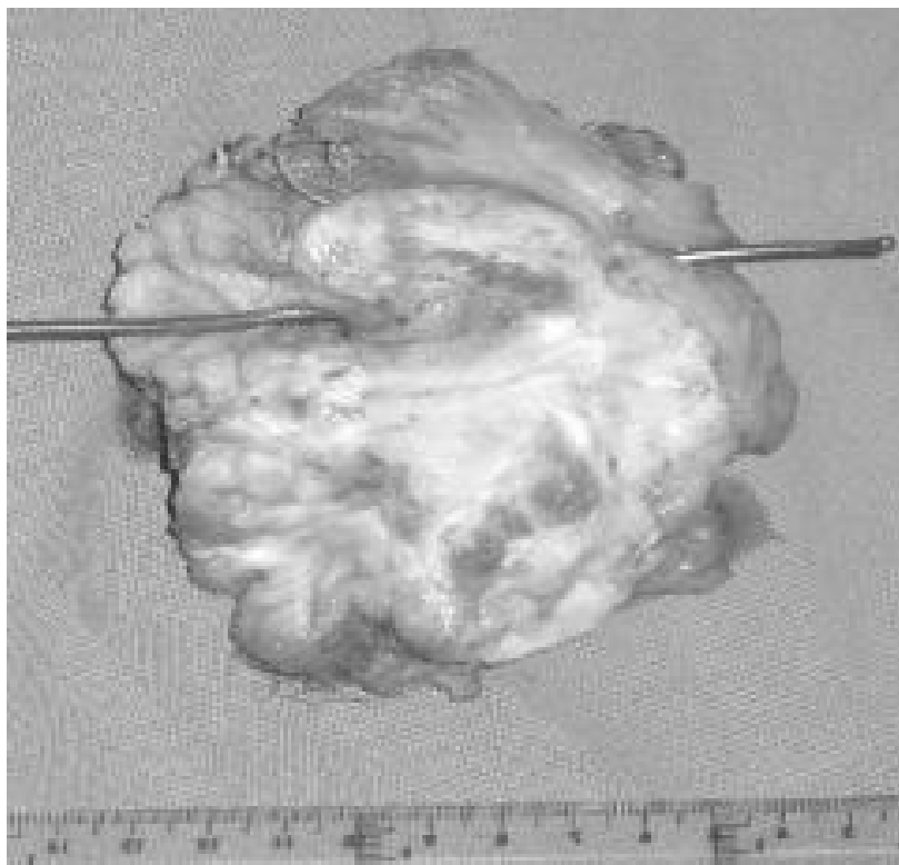
Fig. 2. Rectum with mucinous adenocarcinoma

Soft tissue scar and induration in the left side of the perineum and cutting seton in the fistula canal.