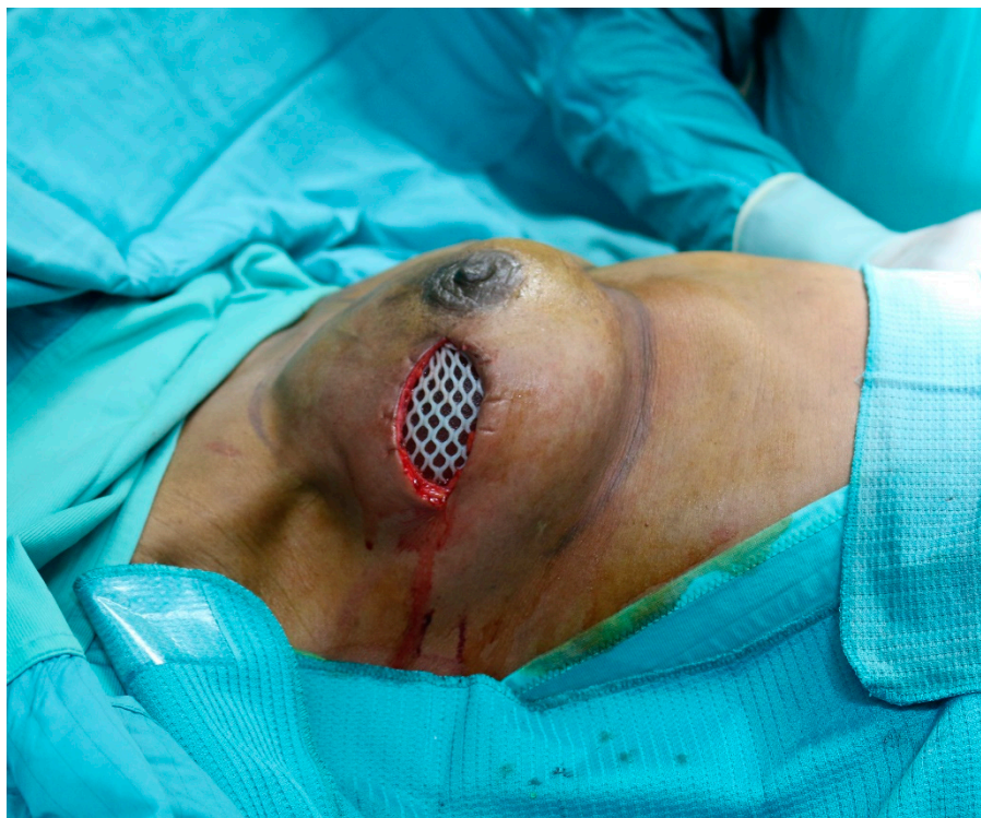
Figure 1. Meshed ADM used to cover the inferolateral aspect of the implant in submuscular breast reconstruction. ADM: Acellular dermal matrix.