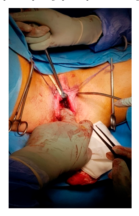
Figure 2. Y-shape incision in the perineum, creating a vesico-rectal cavity.

Afterwards, the stent was inserted into the preformed neovaginal space. The free margins of the skin graft were sutured to the borders of the incisions made in the perineum, creating this way the introitus of the neovagina. In all cases, the vaginal stent was made of silicone, having the shape of a cylinder with a channel inside it, in order to cleanse the neovagina. The patients were put on absolute bed rest and a special diet was given for the first 9 days. The neovagina was irrigated daily through the channel of the stent with diluted (1%) povidone-iodine solution and normal saline. After 9 days, the vaginal stent was removed and the neovagina was checked and cleansed. Elastic panties were worn in order to retain the stent. The sutures were eliminated after 14 days (Figure 4). In the first 3 months, the vaginal stent had to be kept permanently, except when using the toilet or while bathing, in order to prevent the contraction of the vagina. During this period, the patients irrigated the vagina with sodium bicarbonate solution, wormwood tea or a mixture of normal saline and povidone-iodine.