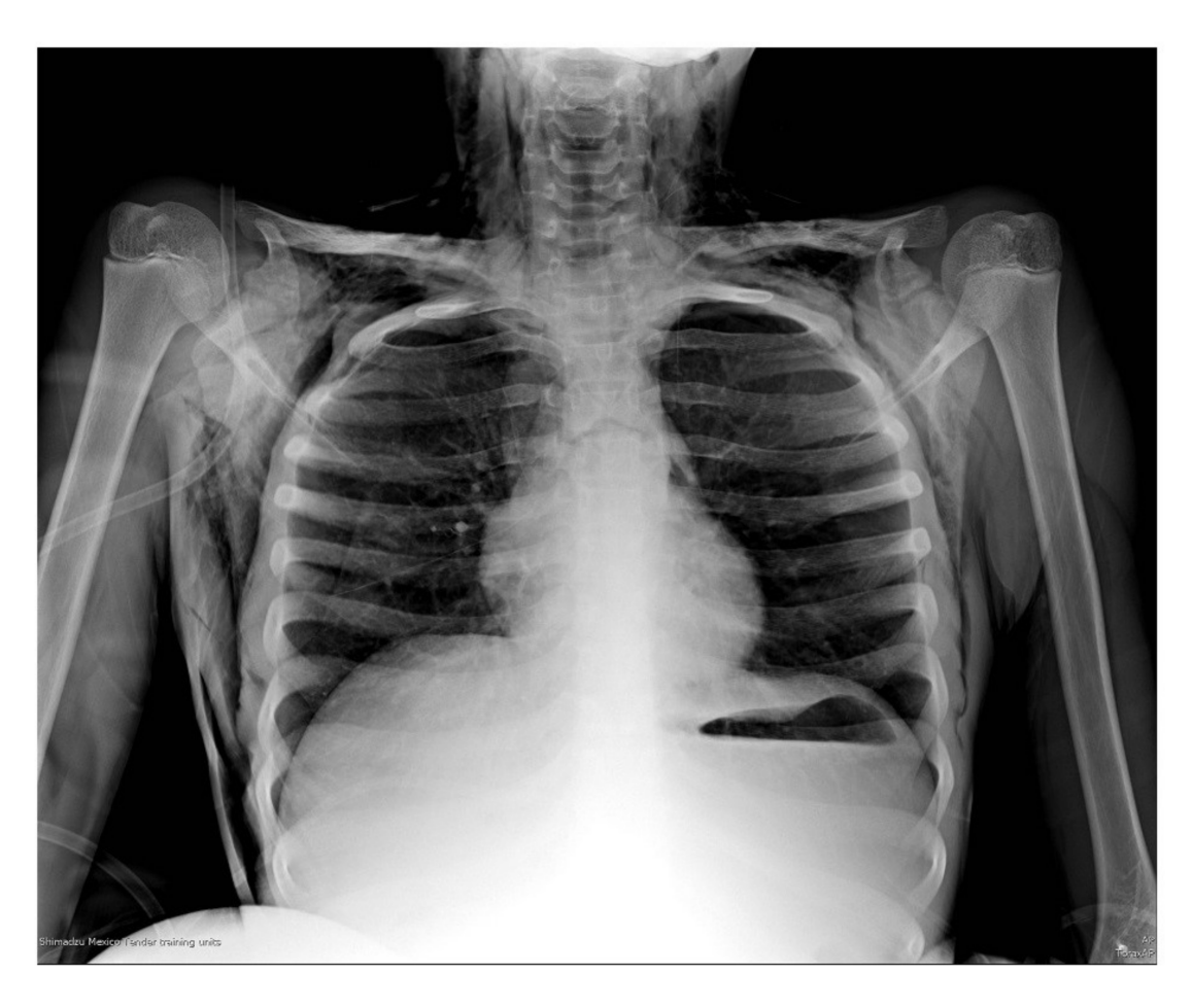
Figure 1. Plain chest radiograph in anteroposterior projection on admission of patient to the ED. A small pneumothorax can be observed in the upper right part of the left hemithorax of approximately 20%, as well as signs of pulmonary hyperinflation, with horizontalization of the costal arches; subcutaneous emphysema can also be observed in the neck and both hemithorax. Unable to visualize the FB.

The bronchoscopy examination showed abundant blood secretions in the oral cavity (most likely of tracheal origin), as well as in the supraglottic space, with epiglottis in omega, and cartilage without alterations. It showed the glottic space with vocal cords without alterations, the subglottic space with edematous stenosis with an approximately 30% reduction of light, and the trachea with membranous and cartilaginous parts with hyperemic mucosa and blood dotting (Figure 2). An inorganic FB was seen in the main carina; however, it was not possible to extract it, as it was trapped in the subglottic space, and required an emergency tracheotomy which was performed without complications with FB extraction through a Björk flap.