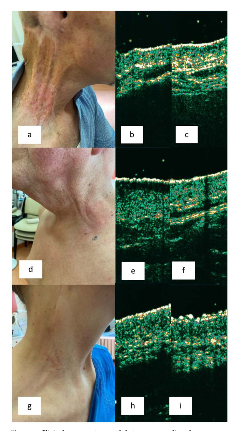
Figure 2. Clinical presentations and their corresponding skin sonograms of the irradiated and control areas. ( a ) Patient with BCC of the external ear with lymph node metastases. 2 years post unilateral radiotherapy (RT). Grade 3 of chronic radiation induced skin injury (cRISI): atrophy, erythema, discoloration, limited mobility. ( b , c ) Sonogram of irradiated skin ( b ) and contralateral non-irradiated skin ( c ). Skin thinning is visible. ( d ) Patient with tonsil cancer with lymph node metastases. 5 years post bilateral RT. Grade 2 cRISI: erythema and swelling. ( e , f ) Sonogram of irradiated skin ( e ) and surrounding non-irradiated skin ( f ). Subepidermal low echogenic band (SLEB) is visible. ( g ) Patient with melanoma in the temporoparietal region with lymph node metastases. 6 years post unilateral RT. Grade 1 cRISI: slight atrophy, telangiectasia, subjective symptoms. ( h , i ) Sonogram of irradiated skin ( h ) and contralateral non-irradiated skin ( i ). Flattened entry echo and slight skin thinning are visible.