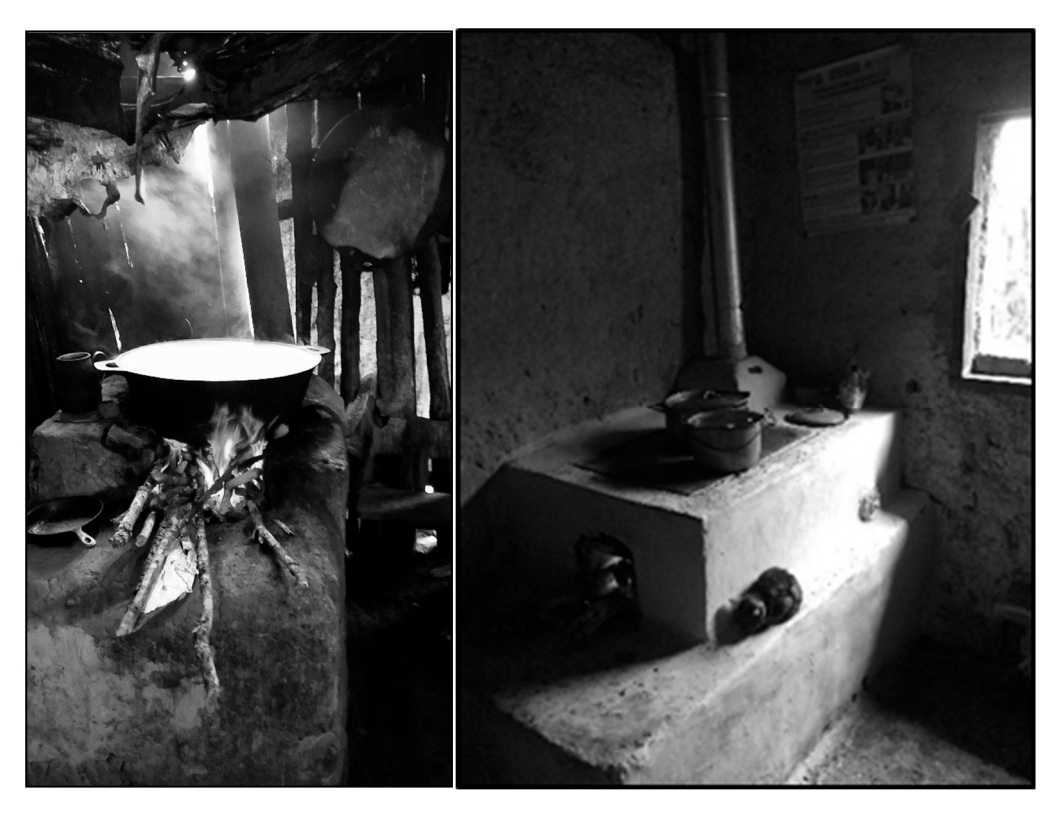
Figure 1. Typical traditional (left) and Justa (right) cookstoves in the homes of Honduran women.

The cleaner-burning Justa stove is a common wood-burning cleaner-burning stove in Latin America with a rocket-elbow combustion chamber, chimney, and metal griddle suited to making tortillas.