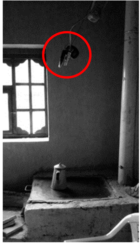
Figure 2. Example placement for kitchen exposure measurements (left) and personal measurements (right).