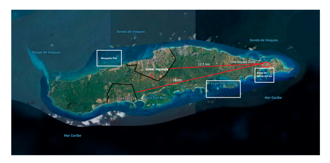
Figure 1. The island of Vieques used as a military bombing range. The live impact zone is illustrated with a red circle right above Bahia Salinas del Sur. Two big communities are located on the island, in the north (Isabel Segunda), which is about 12.5 km from the impact range (red line), and in the south (Esperanza), about 18 km from the live impact zone. The three white rectangles represent fishing areas where queen conch was collected for toxic metal analysis.

For years, the nearby Vieques population was breathing particles that remained airborne during the detonation due to military practices (reaching the populated area a little after an hour). Therefore, it is evident that Vieques residents were exposed during the 60 years (military activity) to polluted ambient resuspended particles originating from military bombing. Although the Center for Disease Control and Prevention (CDC), the United States health protection agency, public health assessment reports [9] that the resuspended particle material does not pose a health risk to the population, we believe that the concentration of contaminants in ambient particulate matter (PM) should have been determined and used for the health risk assessment. However, the PM data, including airborne metal concentration, are inexistent for Vieques. Even though many of these pollutants are known carcinogens, the residents of Vieques have not been monitored for the body burden of environmental chemicals to this date [5,10]. Nevertheless, a later sampling study (on metals) was performed on 500 residents in 2004 and reported by the Puerto Rico Health Department [11].