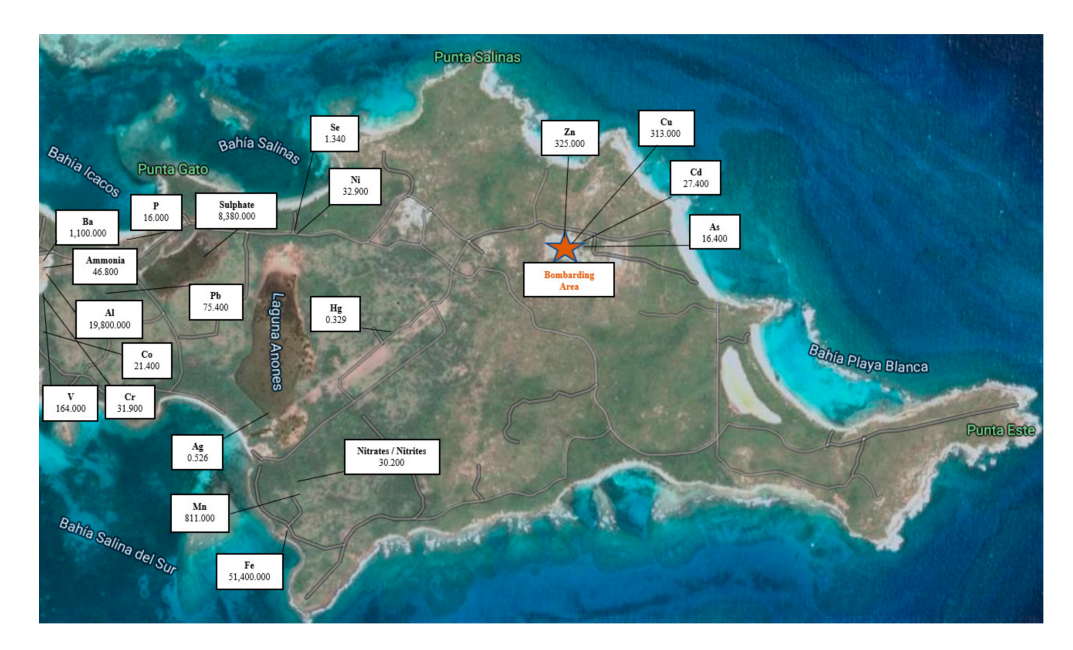
Figure 2. Toxic metal concentrations in soil within the impact bombing range on the east coast of Vieques Island. The concentrations of each metal are shown in the white rectangles (values are shown in parts per million).

Previous studies performed on the residential crop and other soft commodities in Vieques assessed the presence of toxic metals. The results showed significantly higher levels of metals in Vieques as compared to the Main Island Puerto Rico [12]. Furthermore, high levels of toxic metals have been reported in soil samples taken by the United States Geological Survey (USGS) (1994) at the impact bombing range (see Figure 2) [13]. The data gathered in this study are consistent with the hypothesis that toxic metals originating at the target range are airborne and transported to civilian areas (Figure 1) by windblown dust resuspended at the bombing zone.