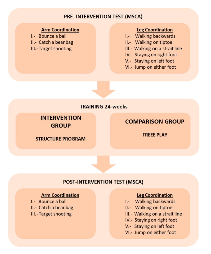
Figure 1. Procedure model.

Intervention group. Participants in this group received an intervention developed from a preschool physical education curriculum developed by Terry [17] based on studies by Corrales et al. [32] and Vaca [33]. The goal of the program was to elicit improvement in fundamental motor skills via appropriate instruction and practice. This intervention focused on the motor and cognitive aspects. Three cognitive and motor areas were fundamentally organized: body schema, spatial schema, and temporal schema. These schemes were being addressed in parallel, the body schema being the basis for the elaboration of the spatial schema, and the protocols in turn serving as the basis for the construction of the temporal schema. The sessions design was based on three aspects: (a) organization of the body scheme (body perception and control, postural balance, breathing); (b) basic motor behaviors (balance, general dynamic coordination, visual-manual coordination); (c) neuromotor behaviors (paratonia, synkinesis, laterality, perceptual-motor behaviors, spatial organization, rhythm and motor activity, time organization and structuring). Each session had seven phases: