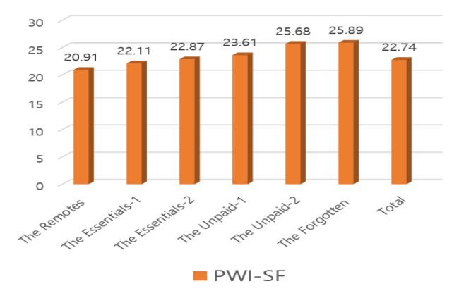
Figure 3. (PWI-SF, Psychosocial Well-being Index short form) Participants' psychological health by our Korean-adapted version of the new classes of occupation owing the COVID-19 pandemic.