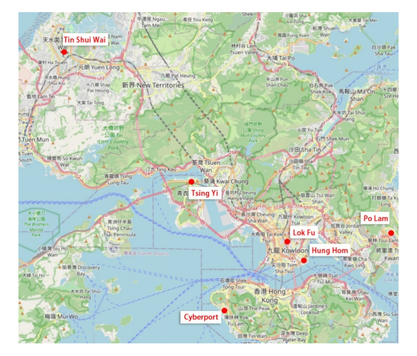
Figure 1. Distribution of the chosen regions in Hong Kong.