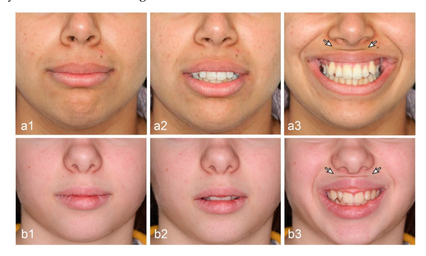
Figure 1. En-face view of two patients ( a , b ) with upper lip horizontal line (ULHL). ( a 1, b 1): No presence of ULHL at lip together; ( a 2, b 2): no presence of ULHL at rest; ( a 3, b 3): full presence of ULHL at smile (see arrow). Note the flip of the upper lip during full smile.

In the present study, we describe the upper lip horizontal line (ULHL), which is a dynamic line that appears only while smiling (Figure 1). Although various parameters of the upper lip were analyzed in the past (e.g., lip length, naso-labial angle, gummy smile), no attention has been given yet to the ULHL and it has not yet been taken into diagnostic consideration.