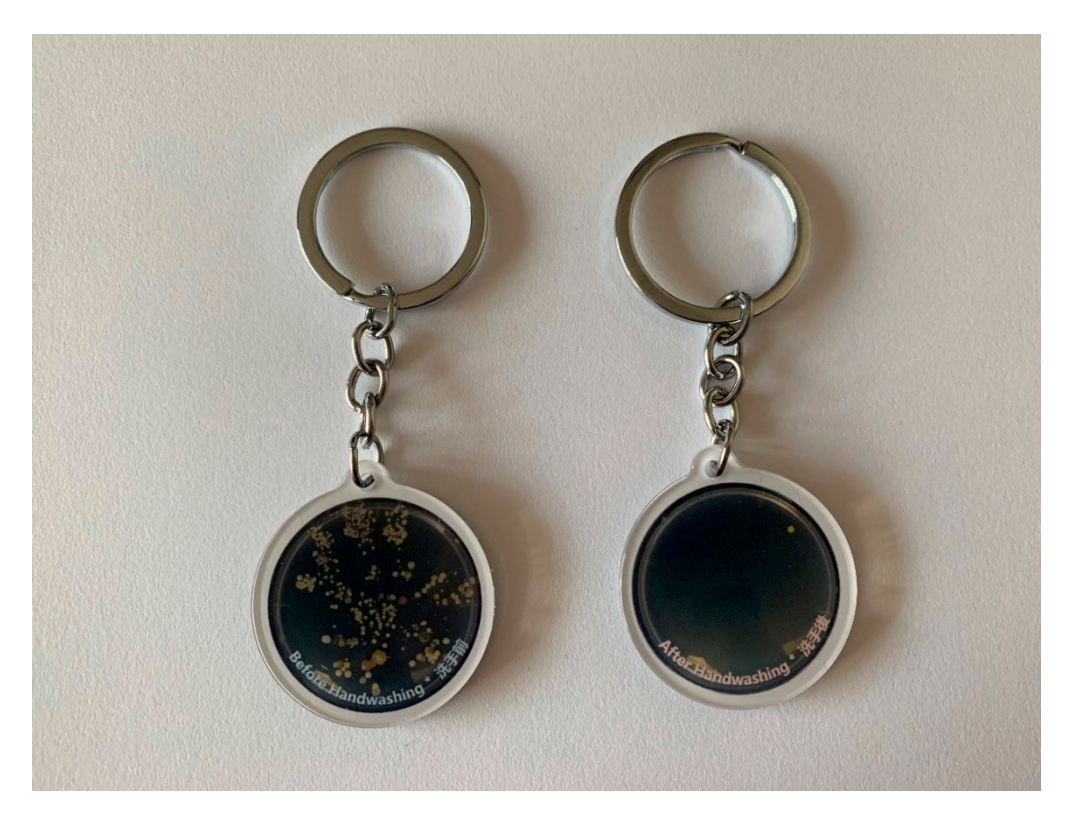
Figure 6. Key chain with handprint photos.

In this final session, the students were given the opportunity to view the results of their respective agar plate cultures. By comparing the handprints taken before and after performing HH, the children could understand the effect of hand washing on reducing bacterial count on the hands. A plastic key ring with photographs of the agar plate culture results (Figure 6) and a bottle of color foaming hand wash were distributed to children as souvenirs so that they would be encouraged to spread the HH messages to their families and continue to practice proper HH at home. The children were encouraged to make a commitment to be "little soldiers" to defeat germs using HH as "weapons" in this closing session.