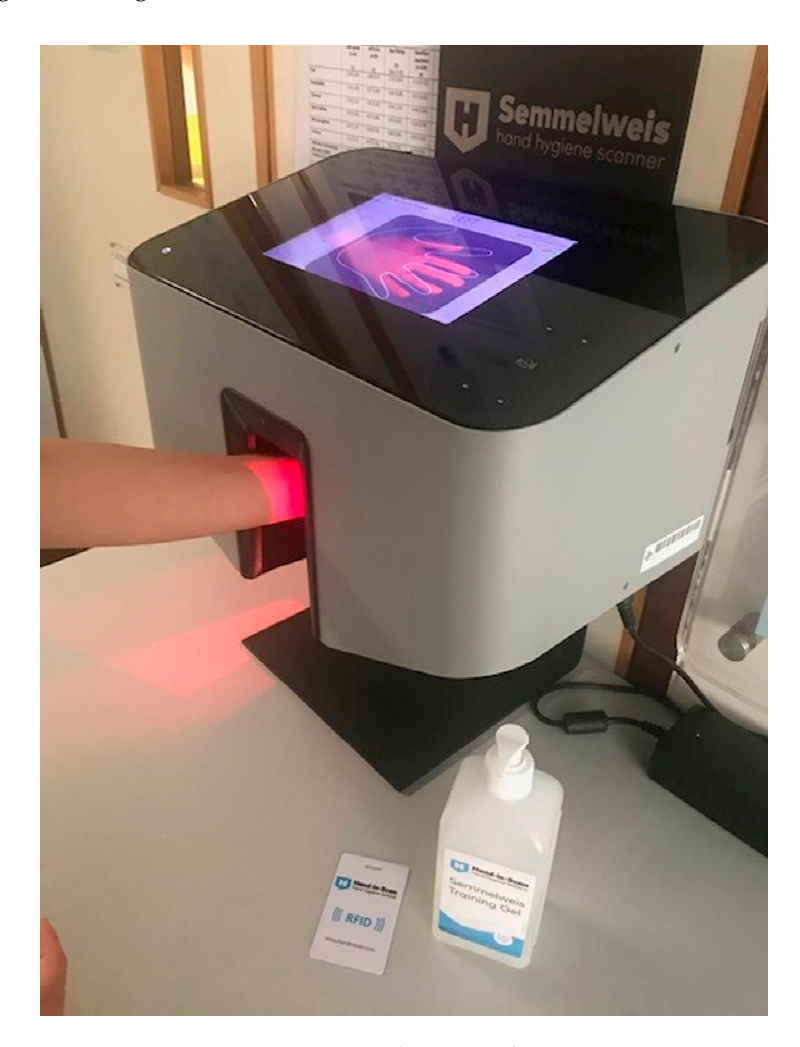
Figure 1. 'Hand-in-Scan' device.

Hand sanitizer coverage on hands was evaluated using a "Hand-in-Scan" Semmelweis Hand Hygiene Scanner (HandInScan Kft, Debrecen, Hungary. Model: HINST20E3WS0P01) (Figure 1). The children were instructed to perform HH following their usual technique by using hydroalcoholic gel that contains a fluorescent agent (Semmelweis Training Gel, Hand Hygiene Training Solution, Budapest, Hungary). Children were asked to get an adequate amount of gel to cover the hands, usually by squeezing one pump (~2 mL) of the gel for hand disinfection. The participants then placed their hands into the "Hand-in-Scan" that could capture the image of the hands in seconds. The screen of the device displayed silhouettes of both hands to show the participants where they should position their hands. A radiofrequency identification card with a code for identification of the participant was provided during data storage.