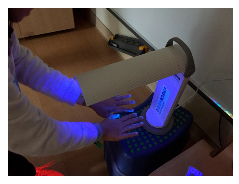
Figure 4. Hands were examined using an ultraviolet lamp (CheckPoint).