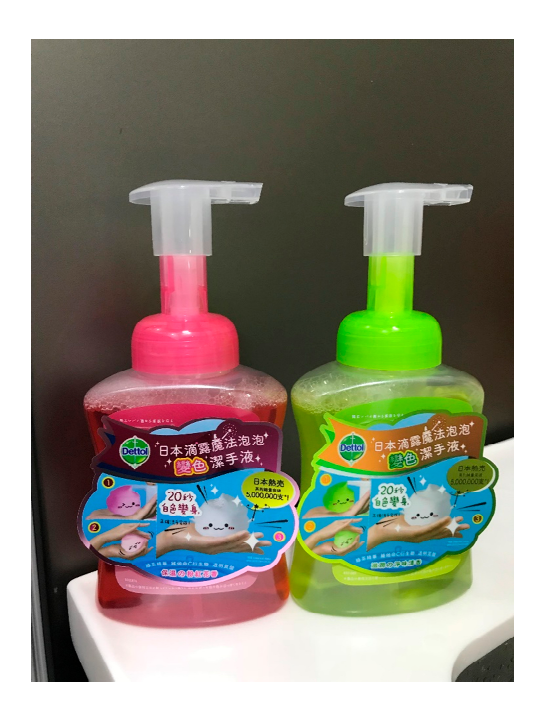
Figure 5. Color foaming hand wash.

This teaching session focused on the "right duration" when performing HH. At the beginning of the session, each child was asked to do a handprint on an agar plate and then taught about the importance of the duration of performing HH. The children were asked to perform subsequent hand washing using a color foaming hand wash (Dettol®, Reckitt Benckiser, Hong Kong) (Figure 5). According to the manufacturer's instruction, the color of the foaming hand wash changes from its original color (either pink or green) to white after rubbing on the hands for 20 s. Therefore, it could serve as a reference for children so that they can spend enough lathering time before rinsing. After hand washing was performed, the second handprint on the agar plate was taken again. The purpose of performing the agar plate experiment was to instill the concept that germs on the hands can be removed through proper HH. The results of the agar plate were shown to the students after culture for one week at room temperature.