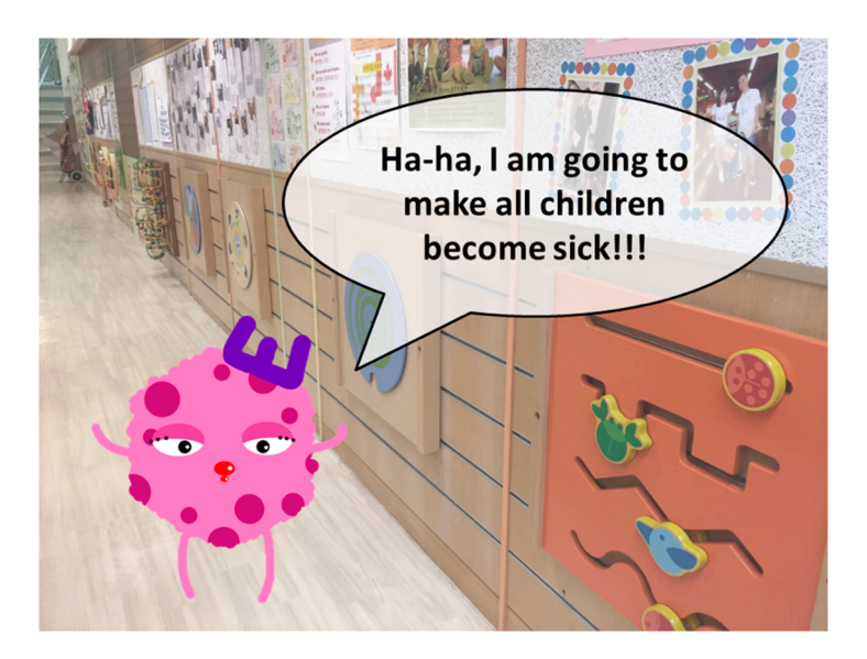
Figure 2. Screenshot of the animated video.

lamp (CheckPoint, 220–240 V/50 Hz; Glow Tec Ltd., London, UK) (Figure 4). This game can enable the children to understand how germs are spread through daily personal contacts and activities and emphasize the importance of HH practice. Moreover, hand drying using paper towels or hand dryers and the proper use of hand sanitizers were highlighted.