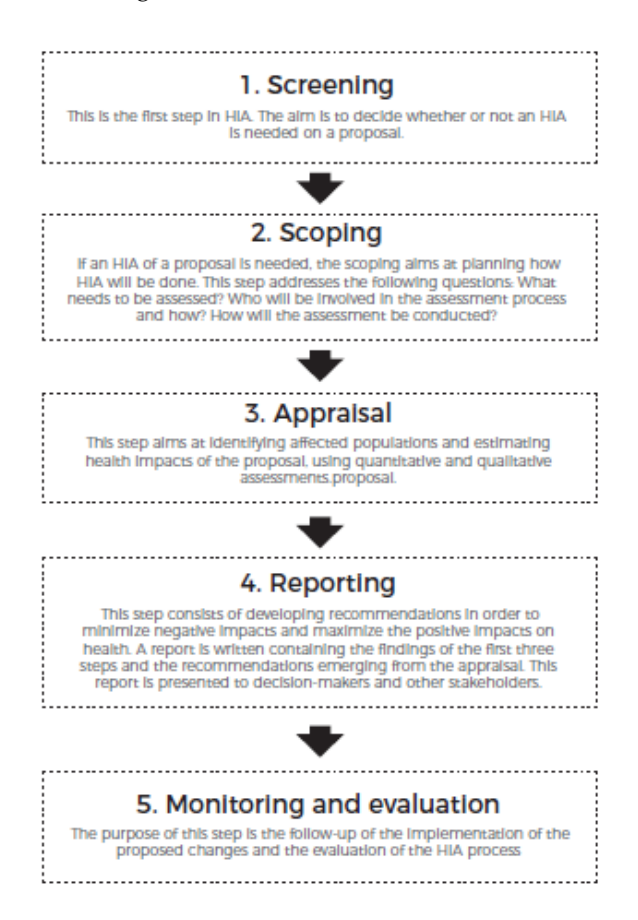
Figure 1. The five steps of the health impact assessment procedure.

HIA is a flexible tool supporting decision making that enables the consideration of health in the development of policies, programs, or projects, particularly outside the health sector [12]. It was developed during the 1990s to complement environmental impact assessments and to better take into consideration social and health inequalities [13]. HIA has been defined by the WHO as "a combination of procedures, methods and tools by which a policy, program or project may be judged as to its potential effects on the health of a population, and the distribution of those effects within the population" [14], and "identifies appropriate actions in order to manage those effects" [15]. The HIA procedure consists of five steps [16,17], as shown in Figure 1.