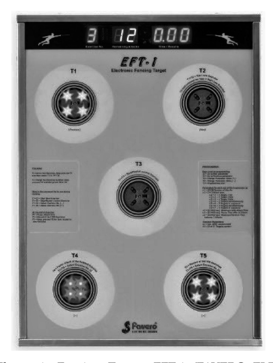
Figure 2. FAVERO: Electronic Fencing Target, EFT-1 (FAVERO ELECTRONICS Srl Arcade (TV)—Arcade, Italy).

The accuracy of hits was assessed using the Favero EFT-1 electronic fencing target (FAVERO ELECTRONICS Srl, Arcade (Treviso), Italy; Figure 2). The device has five targets, each equipped with a LED light. Two targets are placed at a height of around 90 cm above the ground, and the other two at around 130 cm above the ground. The targets are spaced 30 cm apart. The fifth target is in the center of the device, at the intersection of the diagonals. The accuracy of hits and time of completing the test were measured using three different tests protocols. In each test, the participants aimed to hit red targets (which randomly lit up) with the tip of the foil (the button). This approach made it possible to precisely determine the accuracy of straight thrust in each protocol.