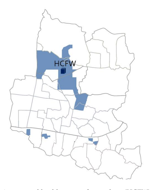
Figure 2. Small businesses and health centers for workers (HCFW) locations in B area.

The area of B region is 53.45 km², population 871,674, and the population density is 16,323 people/km², which is very dense. The area had a total of 60,076 businesses and 291,822 workers in 2017. Among them, 99.1% (59,520) of businesses had less than 50 employees and those businesses employed 73.9% of 291,822 workers. Small businesses in the B region are concentrated in nine large apartment factories. The HCFW is located in a large apartment plant (Figure 2).