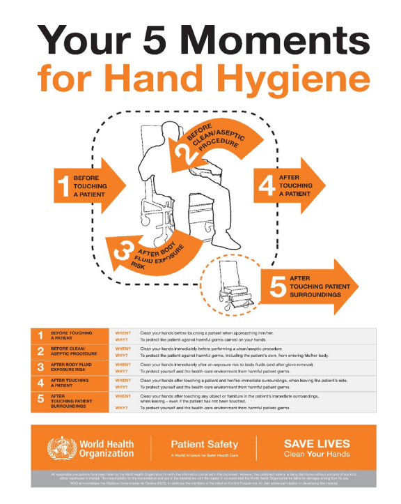
Figure 3. Moments For Hand Hygiene [from WHO Clean care is safer care Your 5 Moments for Hand Hygiene https://www.who.int/gpsc/5may/tools/workplace_reminders/en/ Revised August 2009 (Accessed on 24 March 2020)].