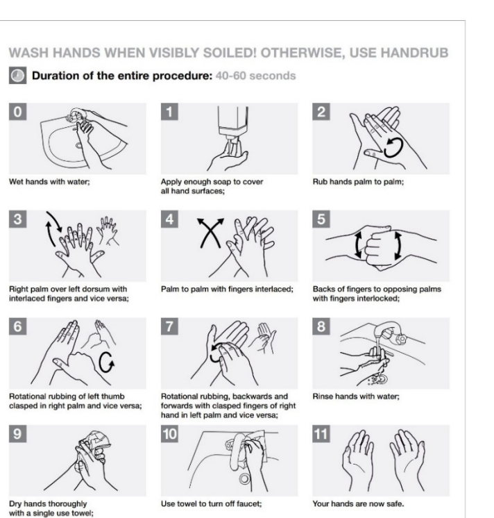
Figure 4. How to Hand Wash? [From: WHO Patient safety. Hand Hygiene: Why, How & When? Revised August 2009 https://www.who.int/gpsc/5may/tools/workplace_reminders/en/ (Accessed on 24 March 2020)].