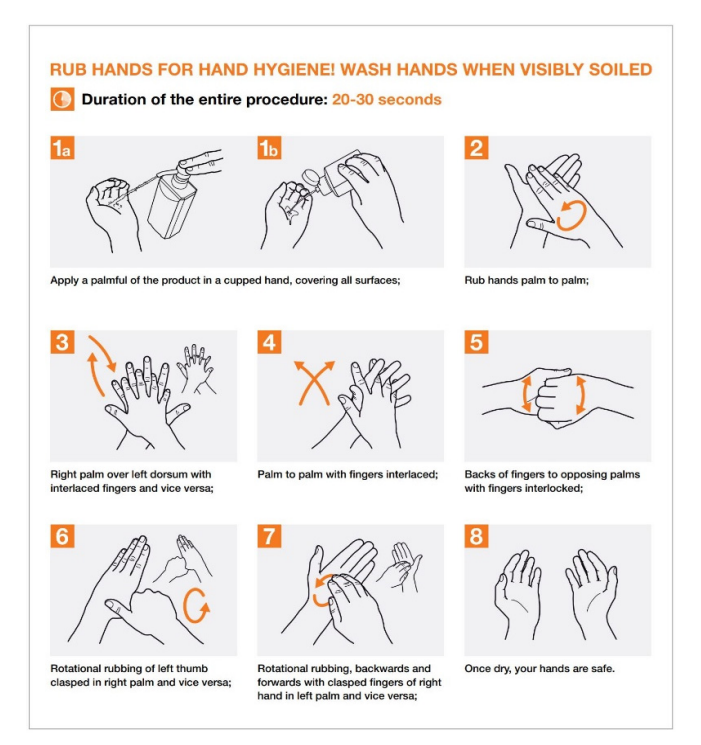
Figure 5. How to Hand Rub? [From: WHO Patient safety. Hand Hygiene: Why, How & When? Revised August 2009 https://www.who.int/gpsc/5may/tools/workplace_reminders/en/ (Accessed on 24 March 2020)].

Before performing hand hygiene procedures, it is suggested to: