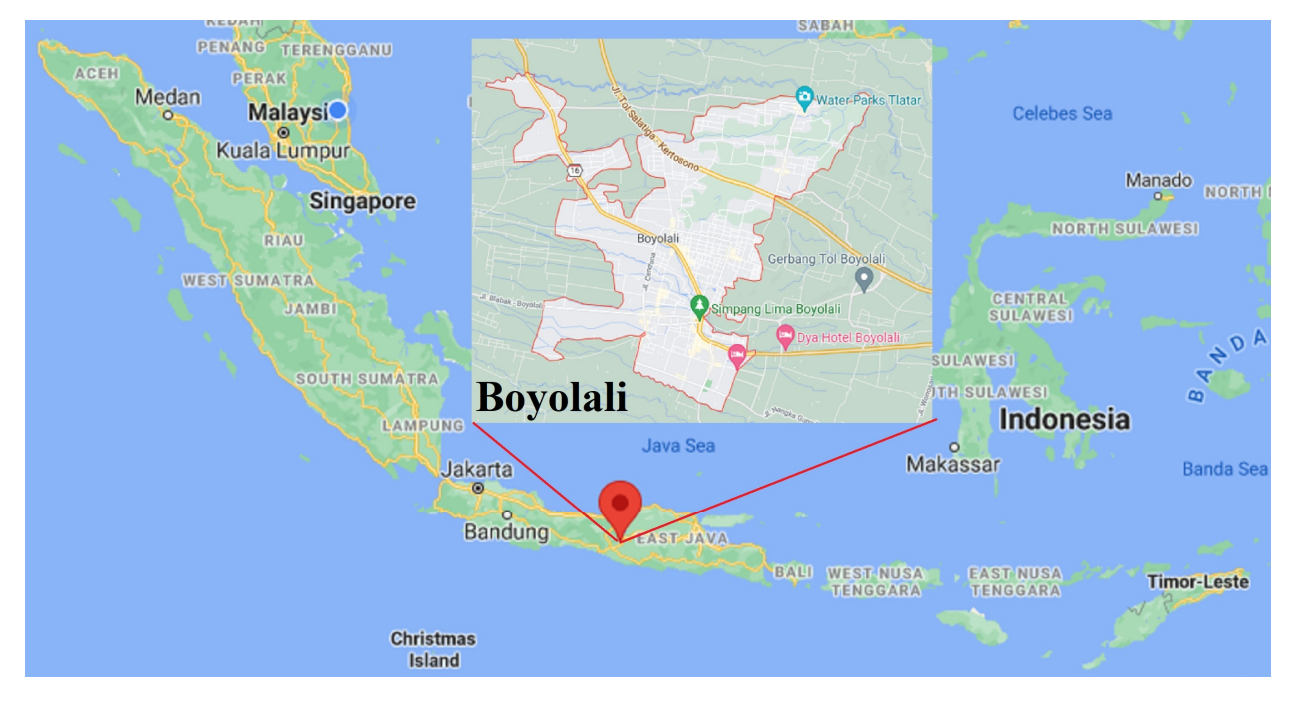
Figure 1. Data collection site of the cross-sectional study. Boyolali, Boyolali Regency, Central Java, Indonesia.

Indonesia is the largest and most populous country in Southeast Asia. It has 271.34 million people and 34 provinces with 416 regencies. The study area is located at Boyolali, Boyolali Regency, Central Java, Indonesia. It is in central Java, Indonesia, surrounded by the Grobogan and Semarang Regency to the north, Karanganyar, Sragen, and Sukoharjo Regency to the east, Klaten and Yogyakarta to the south, and Magelang and Semarang Regency to the west (Figure 1). Boyolali includes 19 subdistricts with 1.06 million populations. The average literacy of this region is 87.52% [36,37].