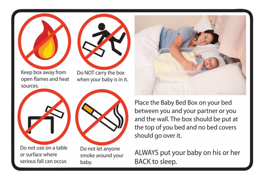
Figure 2. Polypropylene box safety sticker.