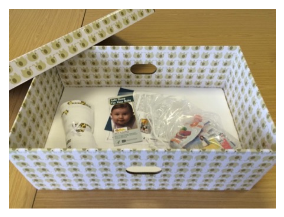
Figure 4. Cardboard baby box with free samples.

a local baby box programme (whether they had received a box or not). Survey participation was voluntary, and no incentives were offered. The objectives were to capture parents' attitudes towards and experiences with the NHS Trust-endorsed cardboard baby boxes.