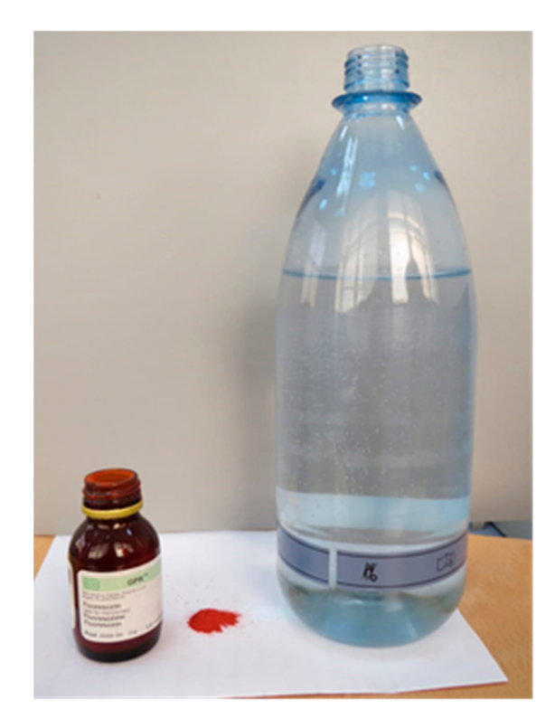
Figure 3. Dispersion of the ultra-filtrate containing the fluorescent dye.

dental manikin (DSEplus Type 5193, KAVO, Warthausen, Germany) was used with a vented tip throughout the cavity preparation, which was standardized by testing the liquid uptake of 1 L per minute. Immediately after cavity preparation, the first filter paper discs were replaced with new ones in all positions. The second set of filter papers were removed after 30 min. The splatter and aerosol contaminated area on the filter papers were calculated by using transparent grids containing a 1 cm<sup>2</sup> box (Figure 4). Each filter paper covered 184 boxes maximum. Even a small amount in a square box was taken as a positive finding.