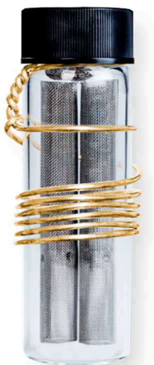
Figure 2. Beacon Passive Soil Gas Sampler.

Beacon Environmental Services, Inc, the undisputed US leader in passive soil-gas sampling and analysis < beacon-usa.com/ > (accessed on 28 March 2021; see the authors' Chapter 2 in the online Supplemental Materials)—supplied both the 12 sampler-tubes used for this study and analyzed them in its laboratory in Forest Hill, Maryland. Its 12 passive samplers are \frac{1}{4} -inch in diameter and 4.5-inch in length, packed with a Beacon proprietary sorbent that targets indoor-air, chlorinated VOCs over a two-week period (see the authors' Figure 2).