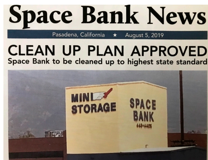
Figure 3. Photo of the first page of a CBRE/TCC brochure, mass mailed to thousands of Pasadena, California residents, that contradicts the cleanup standards contained both in the official CBRE/TCC site documents and in the Covenant Not to Sue that CBRE/TCC negotiated with the state regulator.

CBRE/TCC also repeatedly made this highest-cleanup-standards claim to the public, at multiple Pasadena City Council meetings and on electronic media. For instance, at the audio-recorded and TV-broadcast Pasadena City Council meeting of 9 July 2018, before the city approved CBRE/TCC's site cleanup/redevelopment, CBRE/TCC officials said "The project will also safely clean up the site to the highest applicable regulatory standards . . . [and] will not allow any development to occur on the site unless it's cleaned up to the highest residential standards" [64]. Although there are many other examples, similar to those in the preceding paragraphs, the instances above give a sense of the way CBRE/TCC appears to spread health misinformation through both traditional and social media.