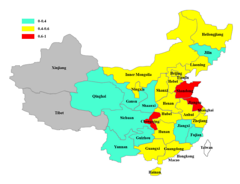
Figure 3. Urban relative poverty rate of provinces and cities in China.