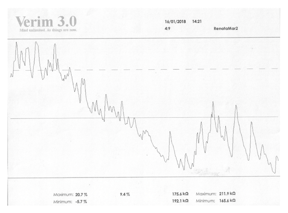
Figure 1. The results obtained in the field of EDA before the GSR Biofeedback therapy. Legend: max vs. min—values of resistance achieved by the patient in kOhm; values on the right refer to relaxation, on the left to activation. Higher values in relaxation training indicate an increase in resistance and thus an increase in relaxation; low values indicate a decrease in resistance, an increase in conductivity, and thus a decrease in relaxation. The values on the left side are the activation level. If relaxation increases, the activation of the organism decreases. Five max values vs. min are the results analogous to those presented in kOhm.

Studies on a group of schizophrenia patients confirm these results. They indicate that in schizophrenia patients, electrodermal activity, EDA, differs in terms of skin conductance responses, SCRs. In patients with positive symptoms, numerous skin conductance responses, SCRs (both spontaneous and non-specific, NS.SCR), are visible versus people in whom negative symptoms predominate, where their reduction is visible. In addition, in terms of general SCL activity and initial values, the graphic recording differs. Patients diagnosed with schizophrenia in remission differ significantly in these two indicators. In these persons, the initial value is usually lower or similar to mean relative changes (this also concerns values associated with activation) [23,47,48]. Below there are photos from our own research showing changes in the SCL and SCRs values (EDA profile) in a patient with diagnosed schizophrenia (Figures 1 and 2).