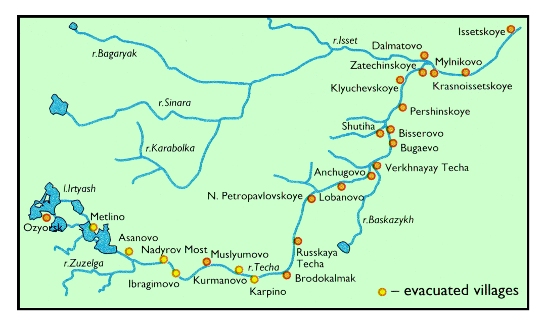
Figure 3 . Villages along the Techa River showing those that were evacuated due to radioactive discharges from Mayak PA (Muslyumovo is approximately 50 km from Asanovo) [1].

The collective effective equivalent dose for the evacuated population amounted to some 1,300 personSv, while it was estimated as being 4,500 personSv for the whole population remaining in EURT territory [15]. The 1967 Karachay incident affected an area covering 63 populated regions, with a total population of 41,500 being encompassed by the 3.7 kBq m<sup>-2</sup> <sup>90</sup>Sr isoline. Cs-137 contamination could be divided into two broad areas [1]: 1,800 km<sup>2</sup> with contamination densities in the range: 11-210 kBq m<sup>-2</sup> and 34 km<sup>2</sup> with contamination densities in the range: 210-765 kBq m<sup>-2</sup>. The average individual dose from external radiation from this contamination was estimated as being 13 mSv for 4800 people living closest to Lake Karachay, while doses of 7 mSv were recorded for more distant populations [15].