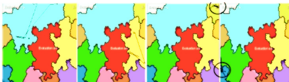
Figure 2. Kohonen topological map of borrowers' scores.

The topological image of the clustering of scores of borrowers is shown in Figure 2. When constructing the Kohonen map for the scoring indicator, the dimensions of the topological map were established ( 30 \times 30 ).