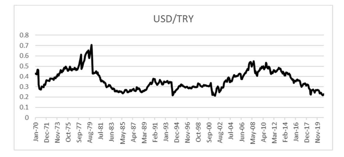
Figure 2. Real exchange rate USD/TRY.

Table 3 reports associated coefficient estimates and Table 4 diagnostic tests. In this section our analyses continue with the pass-through effects and cointegration of exchange rates and per capita income. We provide two different models for examination. First is the original ARDL model, without asymmetric effects. Next is the second model called the NARDL model, where asymmetries are included with decomposed exchange rates as partial summation.