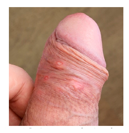
Figure 2. Lesions aspect after 1 week.