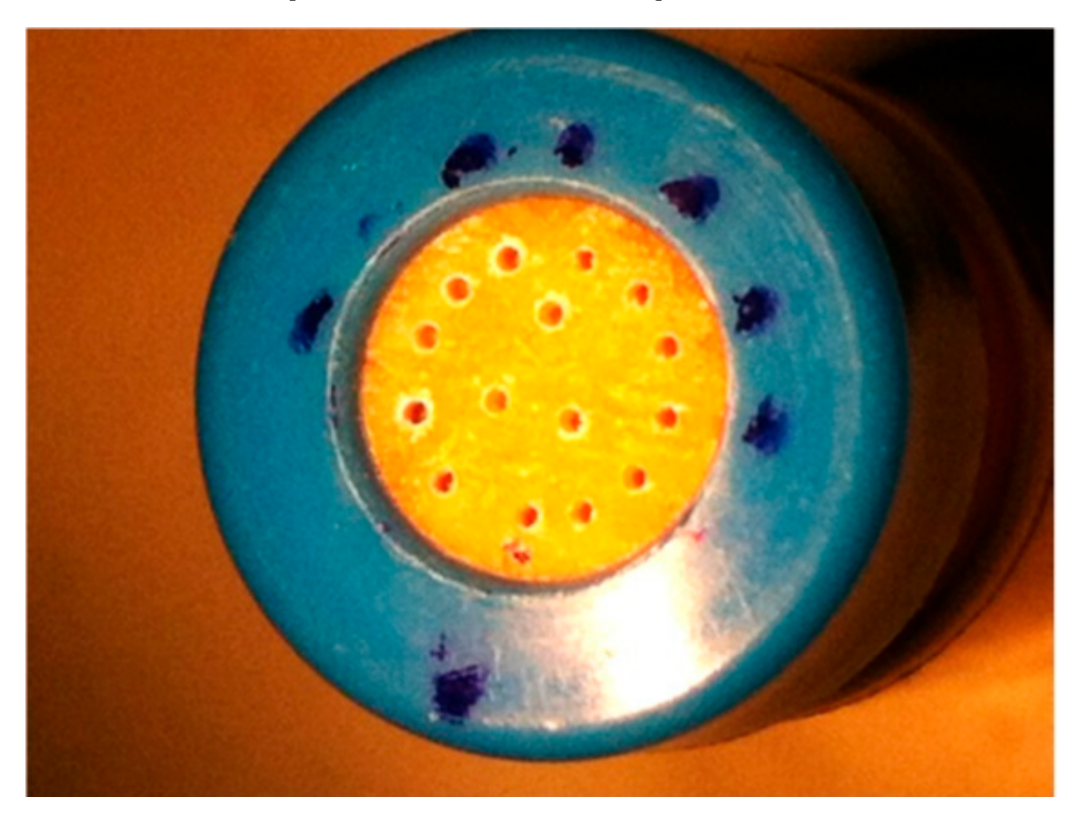
Figure 2. The 12 nail discs of the "perforated nail" toenail group were each drilled with 16 holes using with the Clearanail <sup>®</sup> device.