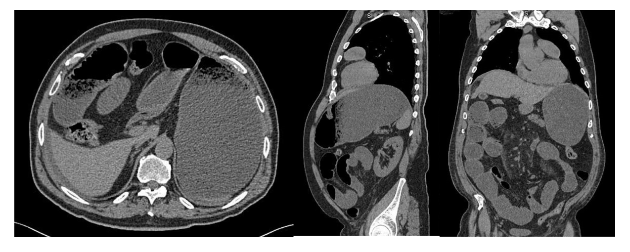
Figure 1. Computed tomography shows distension of some loops of the small bowel, stomach distension, and the presence of a solid mass in the anterior mediastinum on the left, in the paracardiac area.