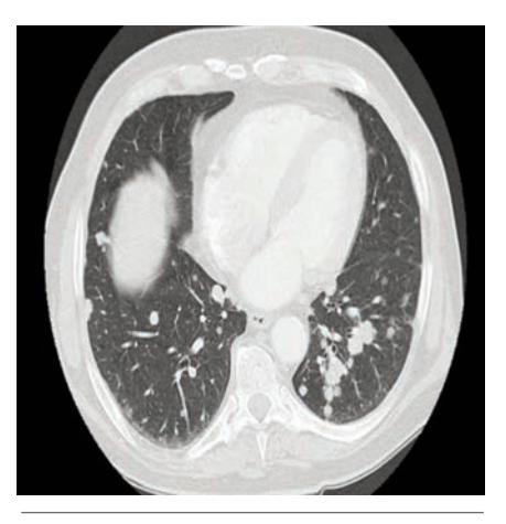
Figure 1. Multiple bilateral lung nodules on computed tomography scan at presentation. Histology excluded the presence of malignant cells.