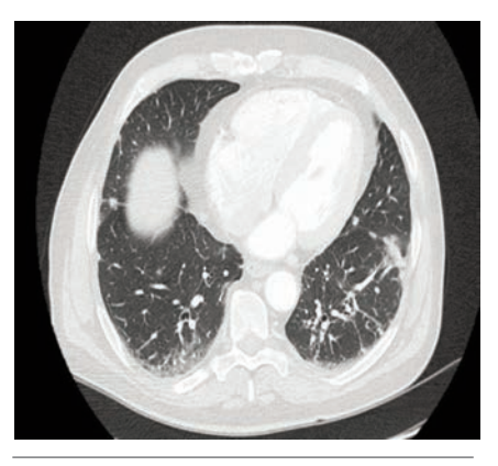
Figure 3. Spontaneous regression of lung nodules on second follow-up (day 60). No therapy had been performed.

intervals, as a spontaneous drop may be possible even in absence of therapy.