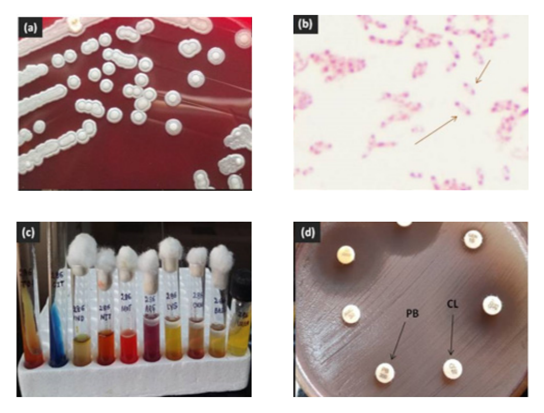
Figure 2. Identification of B. pseudomallei by ( a ) growth on blood agar, ( b ) "safety pin" appearance on Gram stain, ( c ) biochemical reactions, and ( d ) resistance to polymyxin B 300U (PB) and colistin 10 μg (CL) disks.

Following the culture report, the patient underwent incision and drainage of the abscess mass and was commenced on intravenous (IV) ceftazidime administered as intensive therapy (2 gm 8-h) for a prolonged duration of three weeks followed by oral cotrimoxazole (Trimethoprim 240 mg and Sulfamethoxazole 1200 mg) twice daily as maintenance therapy. Glycemic control was optimized with insulin therapy. The fever subsided within a week of ceftazidime therapy followed by symptomatic healing of the neck lesion. The patient was discharged from the hospital on the 25th day of admission with advice to continue cotrimoxazole for six months. On follow-up two-and-a-half months later, complete healing of the lesion was noted.