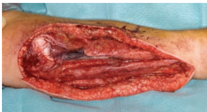
Figure 1. Tibial osteomyelitis.