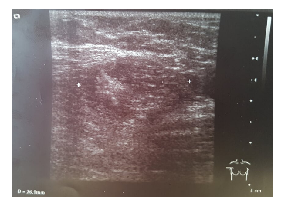
Figure 2. USG examination of the right breast. White characters indicate the range of the lesion.

Figure 1. The clinical picture of the right breast tumor. Visible swelling, redness, and retraction of the right nipple.