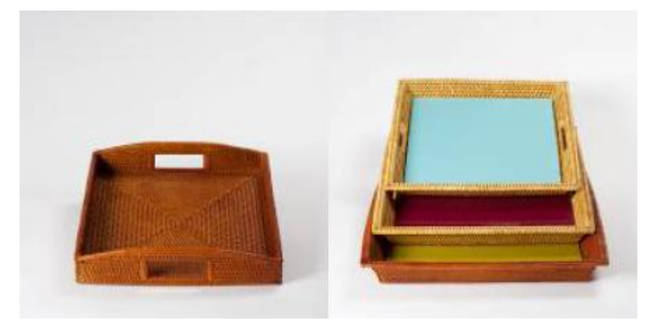
Figure 5. Before, the tray was made of 100% rattan; the company replaced the base of the tray with lacquer, thus reducing the amount of scarce rattan used.