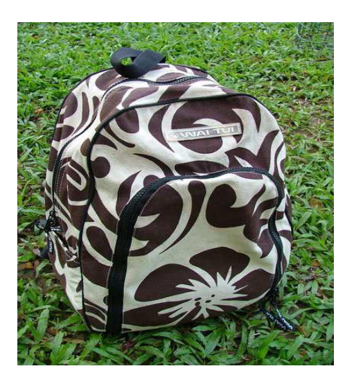
Figure 1. Wai Tui's organic cotton backpack. The redesign uses eco-friendly materials and packaging.

The project resulted in a backpack that will have less impact throughout its lifecycle on the fragile SIDS ecosystem (Figure 1), and that has provided a useful illustration of D4S redesign.