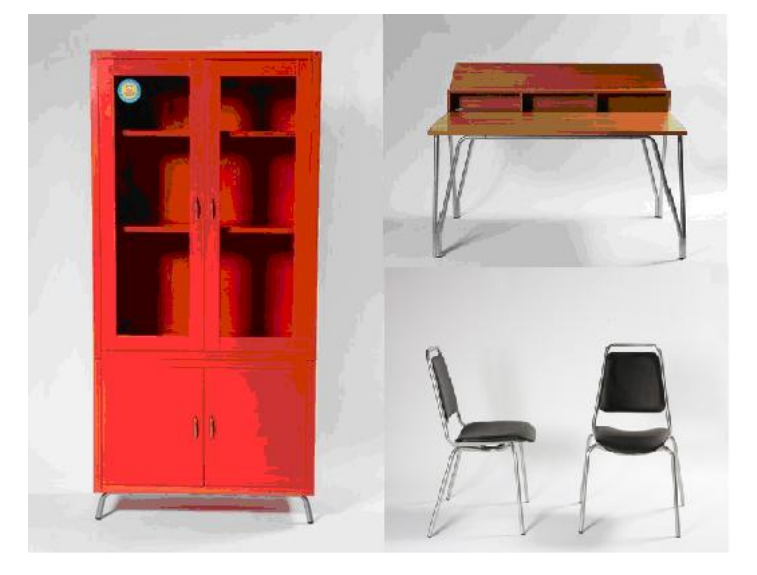
Figure 4. Examples from Xuan Hoa's new, sustainable furniture line.

The Project Innovation Team was made up of 12 company staff members and eight CP4BP experts. The project assisted the company in building-up their capacities in sustainable product development. Although the uptake of the concepts was slow, the company dedicated itself to using D4S to develop a new 14-piece product line that adopts modern styling and advanced technology (Figure 4). In addition, the company significantly improved two existing product lines, desks and wardrobes, by reducing costs and improving quality. In addition to product design and development, the company also made effort to improve the packaging of some products.