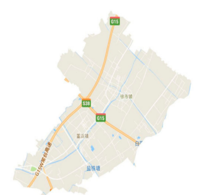
(a) The location of Dongbang Town, Changshu (b) The City on Google map Dongb