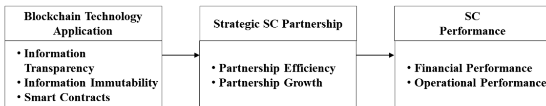
Figure 1. Conceptual model of blockchain-based supply chain (SC) partnership and performance.

Accordingly, this study examines whether performance expectancy of BCT (information transparency, information immutability, and smart contracts) positively influences the strategic SC partnership advantage (partnership efficiency and growth) and positively drives the strategic SC partnership outcome (operational and financial), as shown in Figure 1.