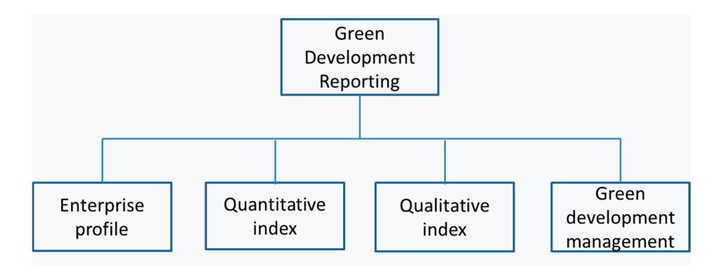
Figure 1. Framework of the proposed green development reporting (GDR).

The GDR framework relies on a series of indicators to represent the state of the GD of enterprises and is divided into four main components: enterprise profile, quantitative index, qualitative index, and GD management (Figure 1). Here, the GD index considers both the qualitative and quantitative indices. Twenty quantitative indexes and eight qualitative indexes were created. The qualitative indexes describe the GD measures and achievements of enterprises, whereas the quantitative indexes use specific data to calculate the -values of GD. This information can be used to compare enterprises or to represent temporal changes within an enterprise in order to show the degree of GD and the potential of the enterprise.