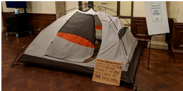
Figure 1. Tent exhibit from Homelessness Awareness Week, with a personal testimony voiceover from a student.

a candlelight vigil where stories about people experiencing homelessness were shared, or attending a political festival centered around homelessness.