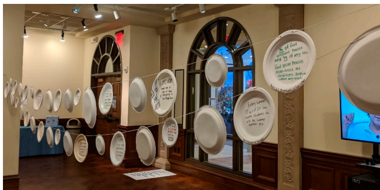
Figure 2. Exhibit with statistics about food insecurity from Homelessness Awareness Week.