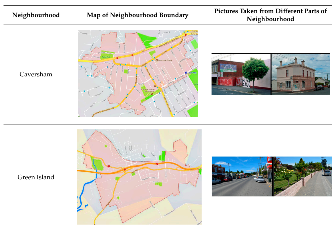
Table A3. Map and pictures of case study neighbourhoods.