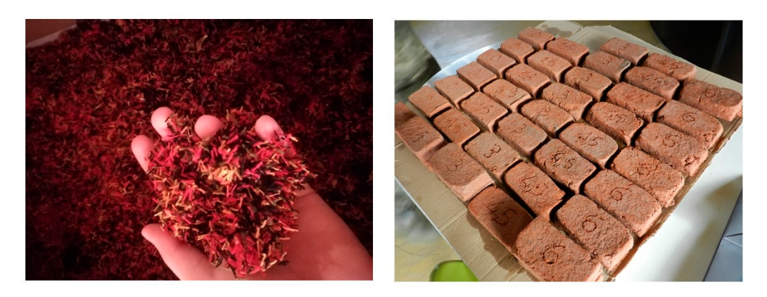
Figure 2. MAST (Mattone in Argilla con Scarti Tessili—Clay Brick from Textile Waste): from textile waste to experimental specimens. On the left, shredded polyester threads; on the right, clay bricks obtained with different percentages of polyester waste.

The polyester threads were shredded into sizes between 2 mm and 7 mm. This process was carried out by hand. The shredded waste was used to make five mixtures with clay in the following waste to total concentrations: 0%, 1.5%, 3%, 4.5% and 6%. Eight specimens were mixed for each blend; each mixture with the five different percentages was mixed by a kneading machine that rotates the clay mixture to make it malleable. The specimens, which measured 120 \times 60 \times 30 mm, were dried and then traditionally fired at the Fornace Carena (Figure 2).