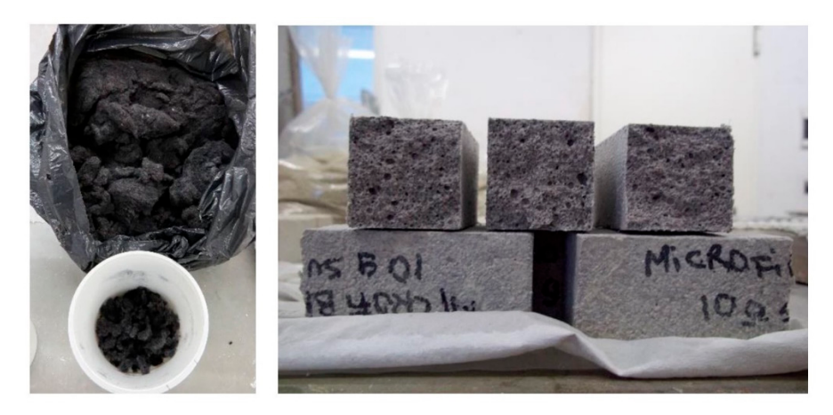
Figure 3. ReCash Plaster (Recycled Cashmere for Plaster): from textile waste to experimental specimens. On the left, wool and cashmere dust; on the right, pre-mixed plaster obtained by replacing glass fibres with textile waste.

waste. The first scenario involves the plaster manufacturer, which would have to invest in a machine for the industrialised dispersion of the fibres in the mixture, which was carried out manually during the experimental phase. The second scenario involves the addition of an element to the supply chain between the company supplying the waste and the company producing the plasters: a third company capable of taking the waste and processing it for subsequent economic exploitation as a new resource. Each of these scenarios presents strengths and weaknesses that deserve to be discussed during the industrial development phase, but each scenario is formulated to foresee economic advantages for the parties involved. In an upcycling concept, some pre-consumption textile waste can be transformed from waste into a resource and included in a new "value chain" [20].