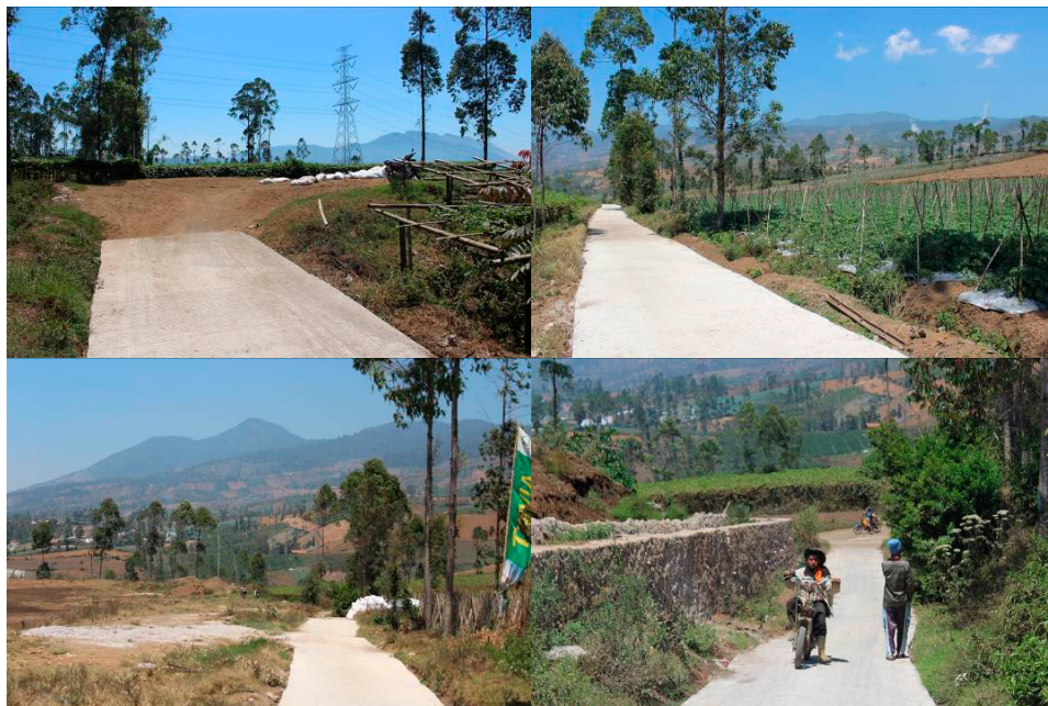
Figure 3. Agricultural road in Padaawas village.

The agricultural road in Padaawas Village, which has a width of 2.5 m and a length of 285 m, is strategically located. It is approximately in the center of the farmland. The farmers decided on the location of the road considering the connectivity, accessibility, and physical safety, as well as the coverage of farmland. They also built a parking area of 10 m × 10 m, which is designated for crop-transporting vehicles. The road may be used by anyone, not only farmers but also traders and all inhabitants of the village. The farm road in Padaawas Village is connected to a project road built by a private company which, in turn, is connected to the village road. The condition of the agricultural road can be seen in Figure 3.