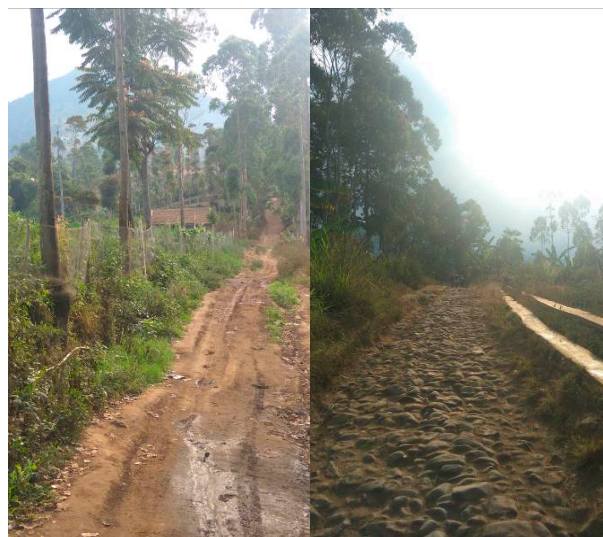
Figure 6. Agricultural road in Pamulihan village.

The road in Pamulihan Village built since 2011 has reached approximately 200 m and is connected to the village road. This road's beneficiaries include around 25 landowners and 1500 smallholders. The road serves farmland that is mainly planted with potato, carrot, and cabbage, which are the primary commodities of Pamulihan Village. It is located on a steep area with an average altitude of 1300 masl and a slope of 15%–40% [44,47]. The quality of the road is low, its surface is slippery and steep. Thus, the road is only traversed by motorbikes and motorcycle taxis ( ojek ). At least 100 motorcycle taxis provide transportation services for crops. The condition of the road is shown in Figure 6.