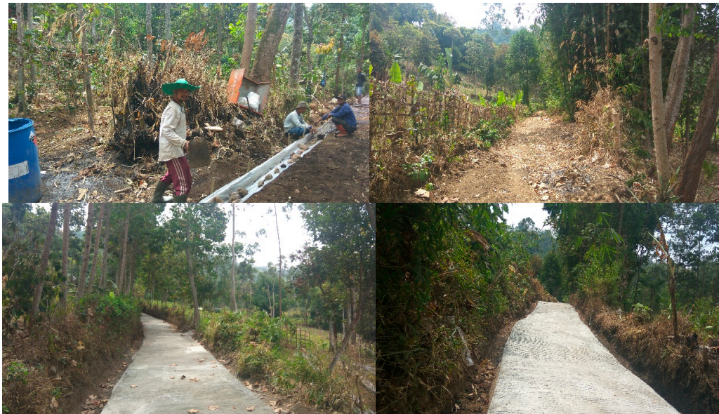
Figure 5. Agricultural road in Panjiwangi village.