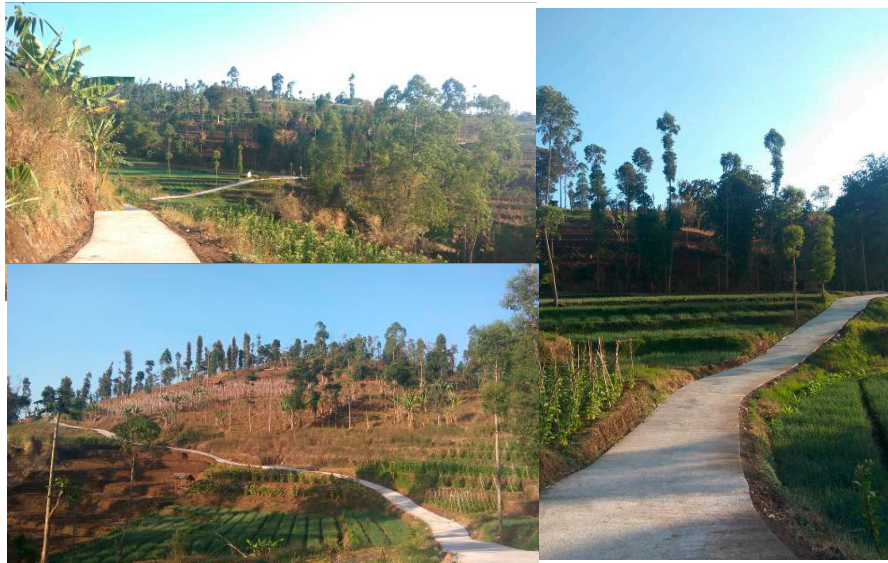
Figure 4. Agricultural road in Bayongbong village.

early stage of development, farmers funded the construction of the road. After that, the farmers received financial assistance from the national government under the Special Allocation Fund of US$ 7300 and US$ 9500, which was provided in 2012 and 2019, respectively. The construction of the road has not run smoothly as there was a farmer who disagreed to share his land for road development in the middle of the development process. Another issue was the funding for subsequent development and maintenance. Farmer groups planned to expand agricultural land that can be reached by roads. Currently, there has been no definite source of funding for road maintenance. Communities collect funds voluntarily if there is a need for road maintenance.