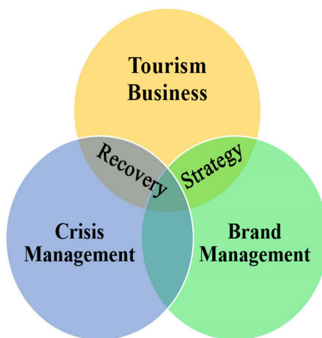
Figure 1. The conceptual model.

Figure 1 depicts our proposed approach, which is guided by brand management and crisis management theories. The rest of the section covers literature around these key theories. Section 2.1 discusses the impacts of crisis and recovery strategies on tourism businesses; Section 2.2 explores crisis management, and Section 2.3 presents the role of brand management during the crisis.