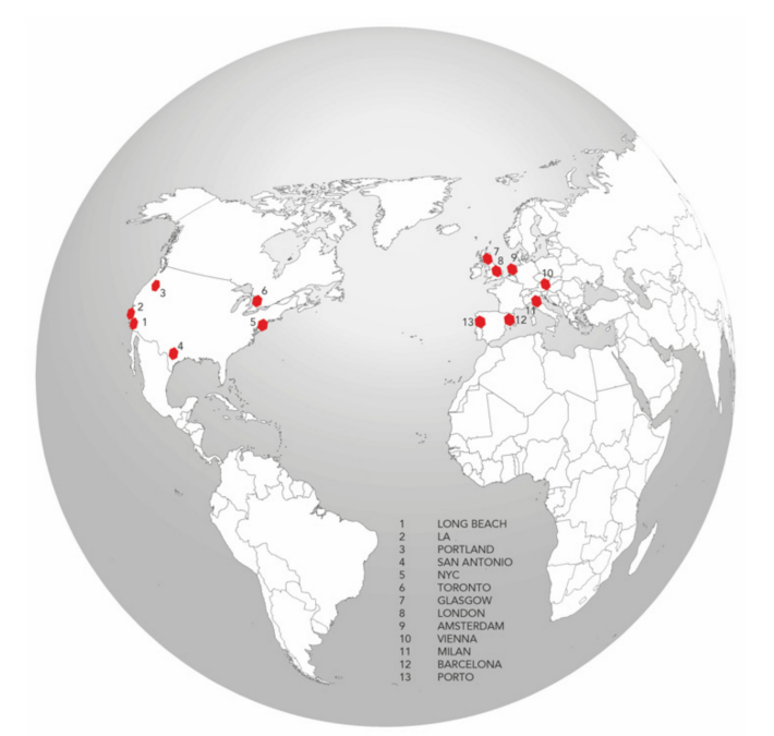
Figure 3. Sample: 13 CCDR smart cities.

The selection of the sample encompassing 13 CCDR cities is justified by the fact that these 13 CCDR cities actively governed the General Assembly 2020, during which the data collection was conducted in November. The semi-structured questionnaire (Appendix A) was filled in by 13 city representatives/strategists appointed for this role by each CCDR city. Regarding response rate, consequently, all the CCDR cities attending the General Assembly filled in the semi-structured questionnaire. Thus, we could consider these 13 cities as the leading and avant-garde group of cities among the rest of the members as they were pushing strategically ahead of the whole CCDR. Figure 3 and Table 2 depict the location and provide insights, respectively, about the 13 CCDR cities in detail.