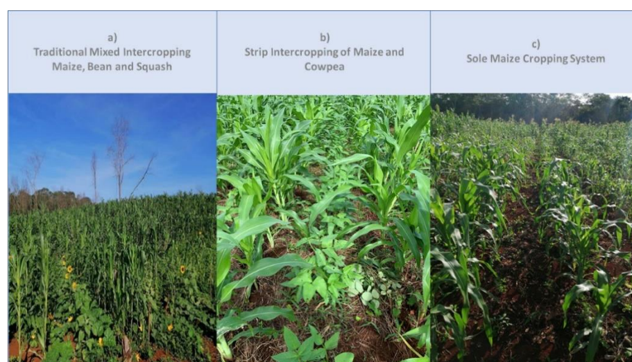
Figure 3. (a) Mixed intercropping of maize, bean and squash; (b) strip intercropping of maize with cowpea and (c) maize monocropping in Yucatan in October 2020.